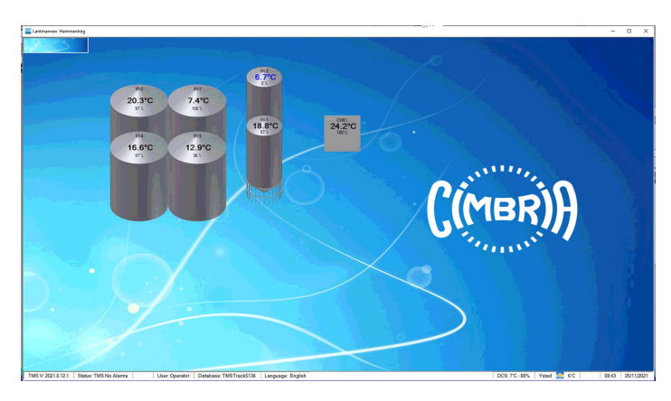
Storage plant view