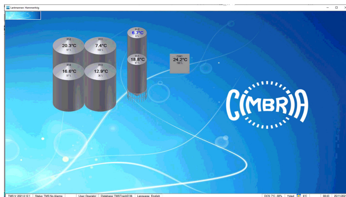
Storage plant view