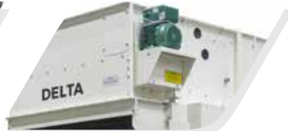
Inlet With Shaker Feeder