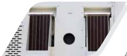
Pre-Suction & After-Suction