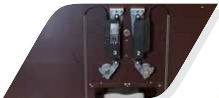
Electronic Control System